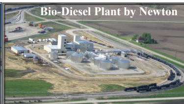
Bio-Diesel Plant by Newton