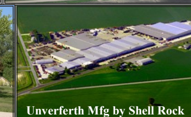
Unverferth Mfg by Shell Rock