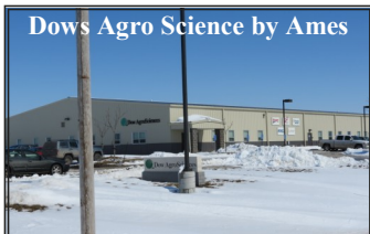
Dows Agro Science by Ames

CIWA is proud of the way it has stepped forward to become a driver of rural economic development. CIWA is a strong and trusted partner with the other rural utility organizations and rural development groups who care about the success and quality of life in rural Iowa. (Pictured below are a few of the recent projects which CIWA has been a proud partner part of.)