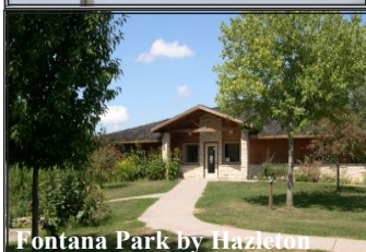
Fontana Park by Hazleton